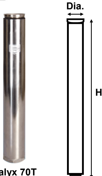
Calyx 70T FN-CALYX70T 1" or 2" Female Connection

70 T" Calyx" nozzle produce a water pattern similar to the lava water, bell, but the water veil rises and forms a calyx shape. The water stream is thicker and individual alterations of the water pattern of diameter and height are possible without the need to change the flow volume. This is achieved by changing the height of the adjustable, outer jacket tube. The nozzle is independent from the water level and is equipped with a strong adjustment flange for accurate adjustment.